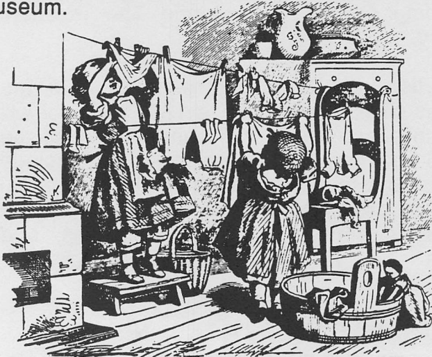
From Grandma Trooley's Old Fashioned Picture Book , Chandler Press, 1988